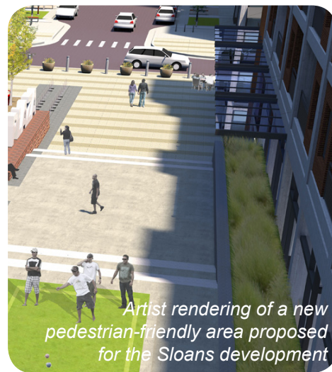
Artist rendering of a new pedestrian-friendly area proposed for the Sloans development

Sloans is a high-quality retail and residential development that is spurring new employment opportunities and economic development in two Denver neighborhoods near a light rail transit line. The project won LEED-Neighborhood Development Gold certification and demonstrates how private development of an environmentally challenged site can make them assets to the surrounding neighborhood.